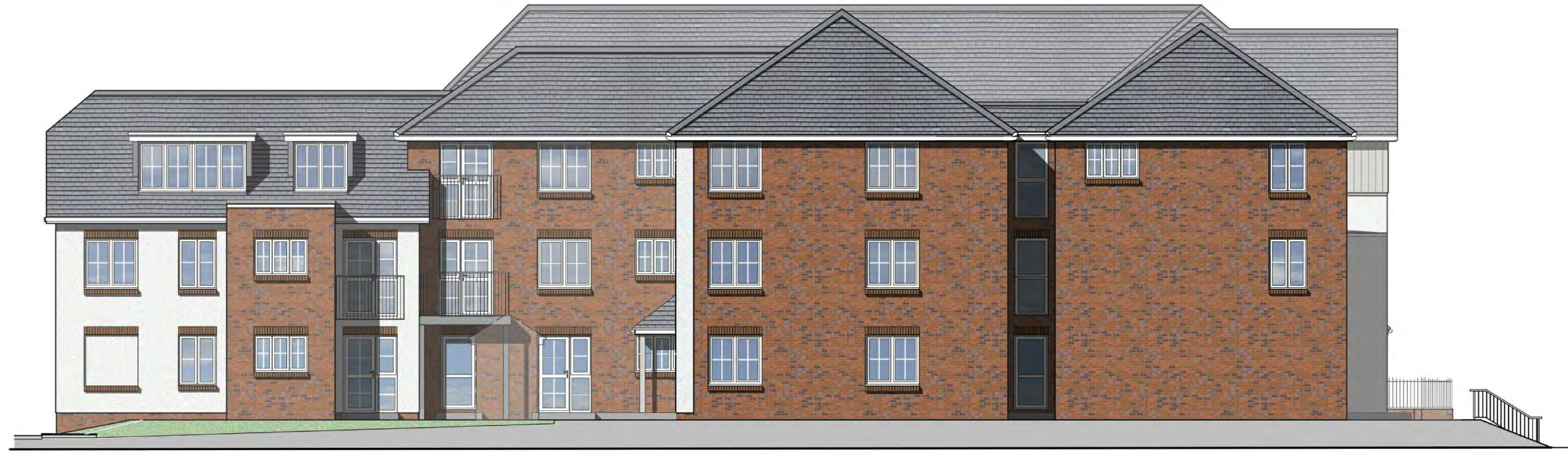
Elevation DD 1:100